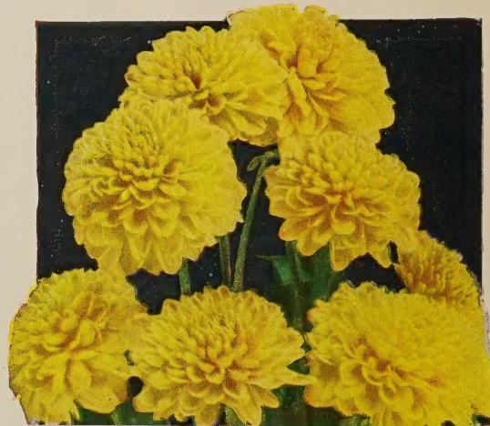
YELLOW BLANKET. 50c each; 3 for $1.25